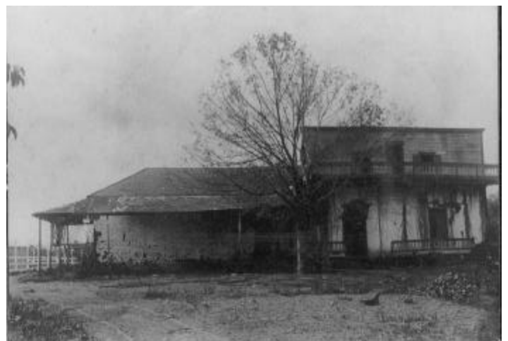
Pio Pico Adobe in the early 20th century from the website