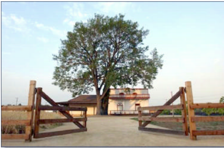
Pio Pico State Historic Park