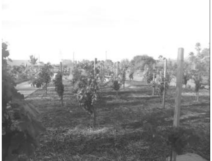
vineyard at the four acre Pio Pico State Historic Park

Please call 714-772-1363 for more information