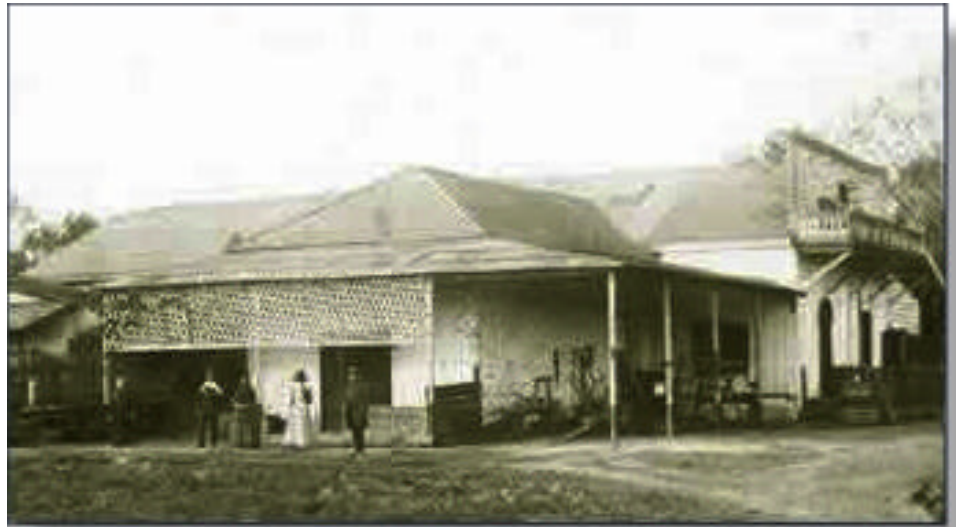
"El Ranchito" in the 1880s