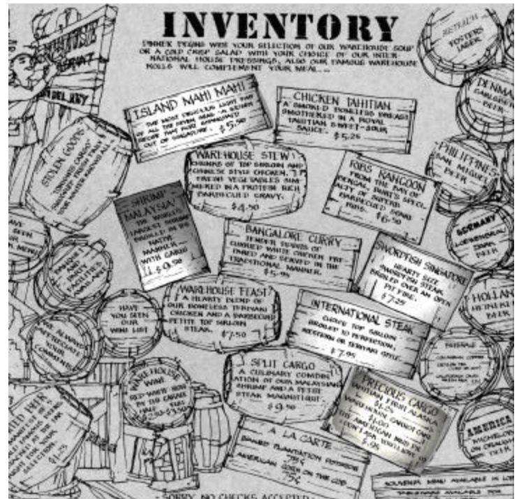
from the Menu Guide The Warehouse Menu 1976