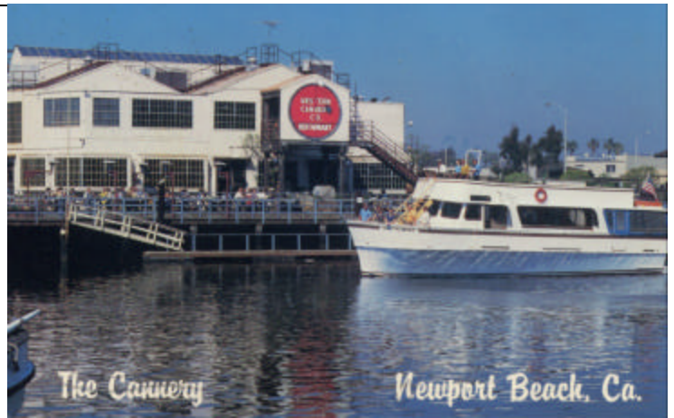
Postcard courtesy El inor Schmidt

Recent gift sent to the society by Ellery Sorkin of Northridge is a Menu Guide of Orange County published in 1976. Some of the restaurants are still in business many are not. Such restaurants as the Hof's Hut, The Quiet Woman, The Hungry Tiger, and The Velvet Turtle are listed in the guide but are no longer in business in Orange County. The guide includes a copy of the actual menu something that the yellow pages are including now. The biggest change is in the prices on the menu.