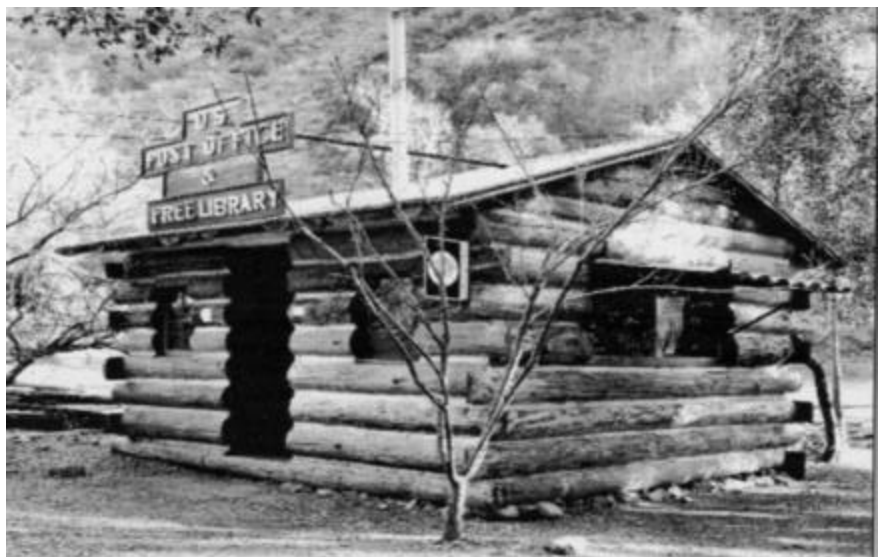
The Silverado Post Office and library still in a log cabin in the 1950s.

Additional purchase information is available by calling 714/9736609 or logging on to the Historical Commission's website at www.ocparks.com .