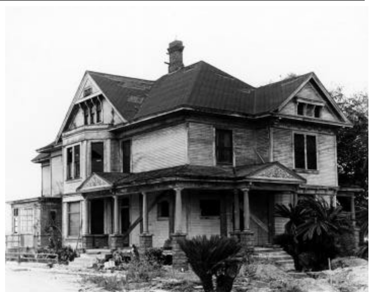
Former John Maag House shortly before it was moved, May 1982 showing a view of the front and left side.

Our meeting place is the Kidseum on the northwest corner of Main and 18th Streets in Santa Ana. Parking in back, with entrance at back and side of the building. The public is welcome.