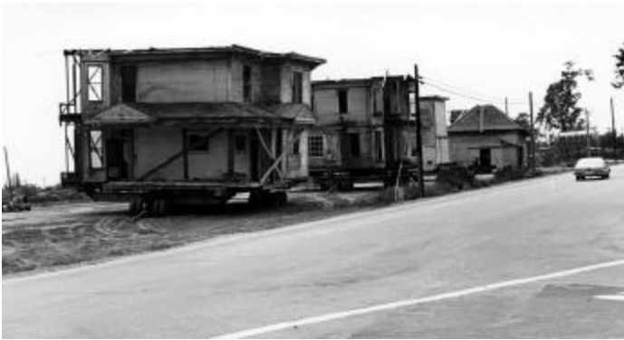
The house, carriage barn and water tower ready for move to Centennial heritage Museum